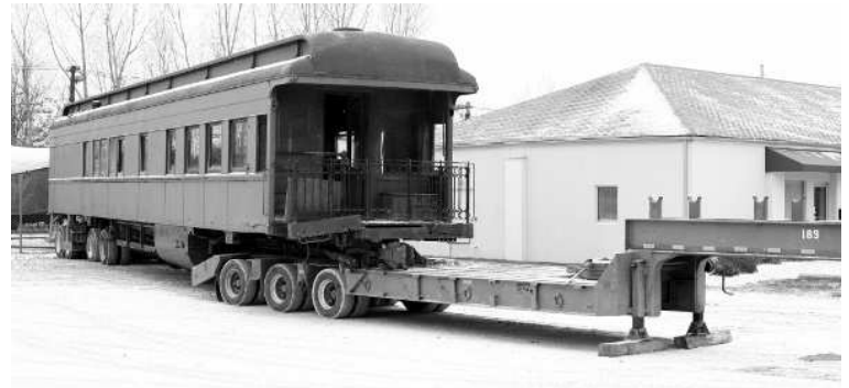
The Pennsylvania RR observation car Williamsport in the parking lot of the Ohio Railway Museum on December 2, 2008.

We were driving past the Ohio Railway Museum on Proprietors Road when we spied the Pennsylvania Railroad observation car Williamsport loaded on a trailer. It was headed to the Dennison Depot Museum in Dennison, Ohio to be restored and displayed. The O.R.M. has begun disposing of their steam railroad collection, and will focus on their electric trolley collection.